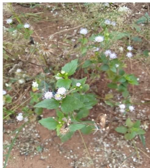
Figure 1: Fresh leaves of A. conyzoides Linn (Billygoat weed).

Fresh leaves of A. conyzoides were obtained from the surroundings of campuses II (5.79093 ° N, 6.09847 ° E) and III (5.78072 ° N, 6.10169 ° E) of Delta State University, Abraka, Nigeria (Figure 1).